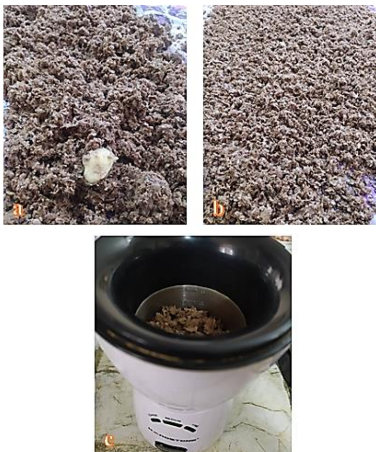
Fig. 1. potato peel Preparation process: a) Fresh potato peel samples before washing; b) Dried potato peel samples; c) Grinding dried potato peel samples using a laboratory grinder

Fresh potato peel samples were sourced from Shahd Pak Food Industries Company (Tapis), located 20 km from Mashhad on the Mashhad-Quchan road (Fig 1a). The collected peels were washed with distilled water to remove any impurities and air-dried under shaded conditions (Fig 1b) to preserve bioactive compounds. The dried samples were ground into a fine powder using a laboratory grinder (Fig 1c), then sieved through a 40-mesh screen to ensure uniform particle size for subsequent analysis. The experiments were carried out in the chemistry laboratory, Department of Food Science and Engineering, Ferdowsi University of Mashhad.