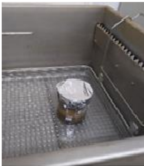
Fig. 2. Ultrasonic-assisted extraction process with vCLEAN1-L20 Model: Sample-containing beaker suspended in the ultrasonic bath

The extraction was performed using an ultrasonic cleaner device, model vCLEAN1-L20 from Beker. This device operates at an ultrasonic power of 400 watts and a frequency of 40 kHz. The tank is made of 304 stainless steel with a volume of 20 liters, and the temperature can be adjusted up to 80°C. Additionally, the device features degassing capability and adjustable cleaning time.